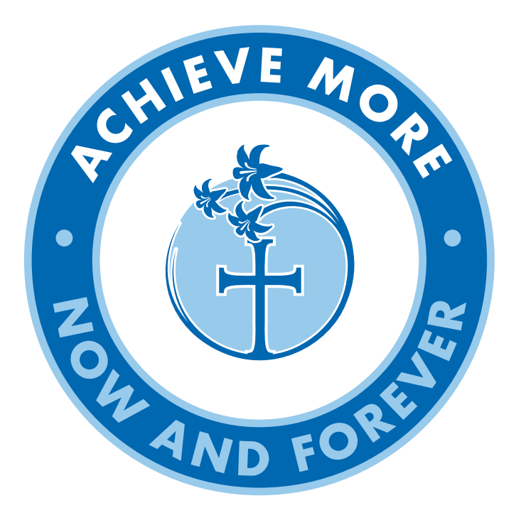
A Capital Campaign for Mount Notre Dame