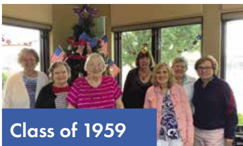
Class of 1959

The Class of 1959 celebrated their 65-year reunion at Slatt's. The group tries to get together every year.