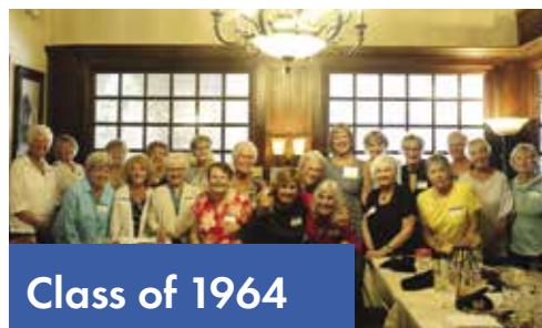
Class of 1964

The Class of 1959 celebrated their 65-year reunion at Slatt's. The group tries to get together every year.