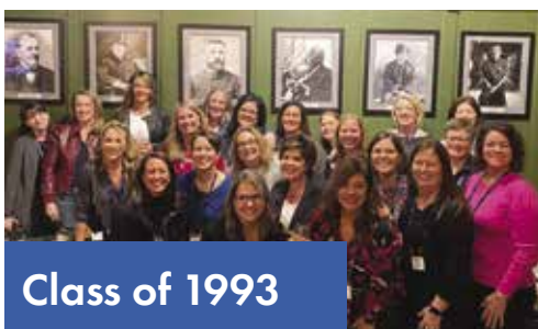
Class of 1993

The Class of 1964 celebrated their 60-year reunion at deSha's. The group reconnected and tallied up the amount of grandchildren those present had – totaling 97 grandchildren and great-grandchildren!