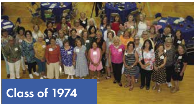
Class of 1974