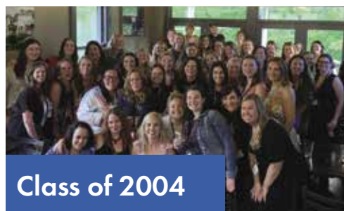
Class of 2004